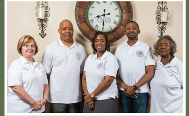
Your Harris County MUD 217 Board of Directors!

Director Spotlight Upcoming Events Heritage Park Past Events Holiday Hosting Numbers to know