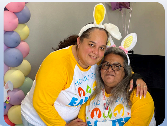
(Above) TXMGMT at the 2024 Easter Event.